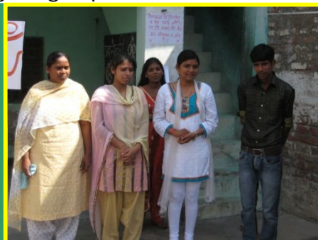
The dedicated team, Sopan Vidyalaya teachers